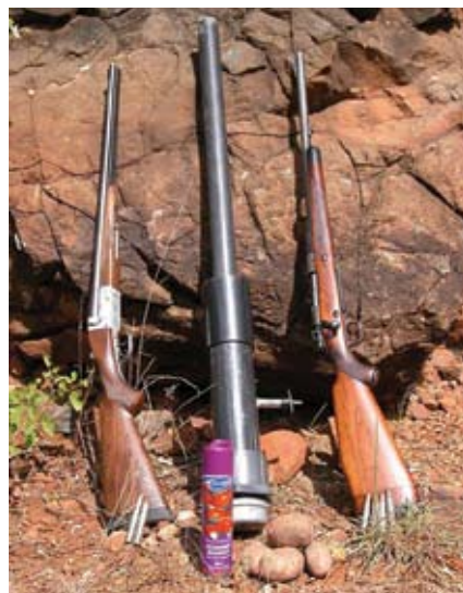
The arsenal the trio carried into the bush with “Mama” in the middle.